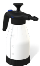
1.5L Foam Unit (F1.5L)

While most portable foaming units will work, we recommend Foam-It equipment. The units featured here will provide ease of use, but sizes up to 50 gallons available at www.foamit.com .