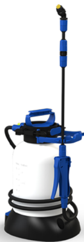
5.0L Spray Unit (SP5.0L)