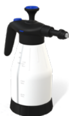
1.5L Spray Unit (SP1.5L)

Portable spray units used to apply the stock solution must leave the surface visibly wet. We recommend Foam-It equipment. Two options are featured here, but sizes up to 50 gallons are available at www.foamit.com .